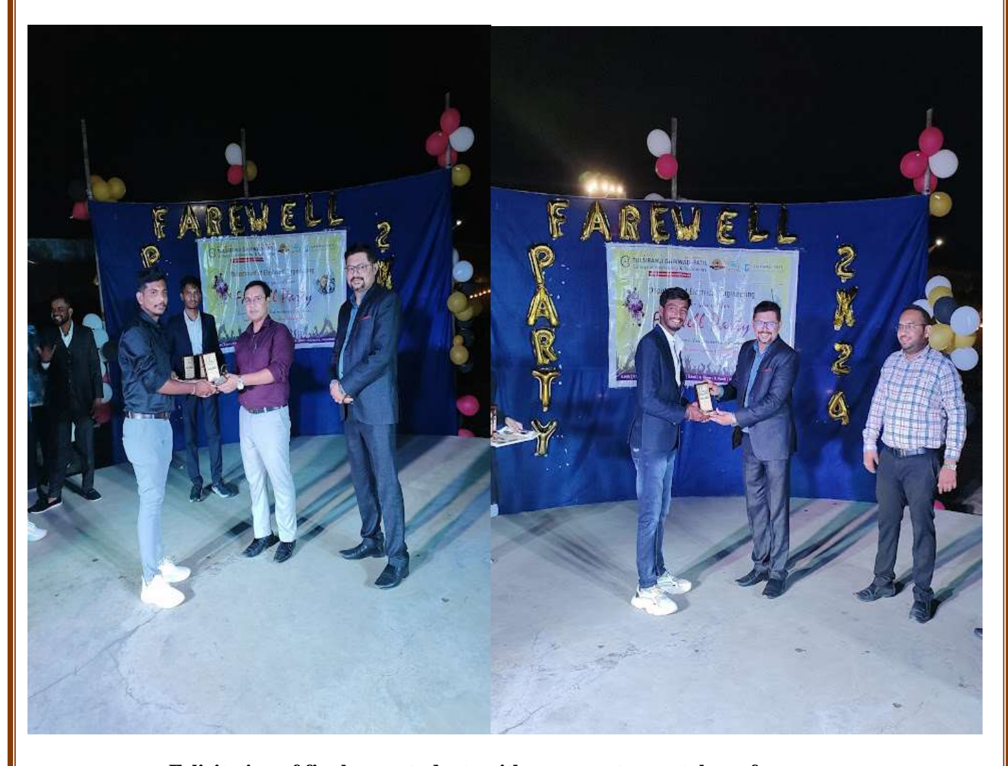
Felicitation of final year students with a memento as a token of memory