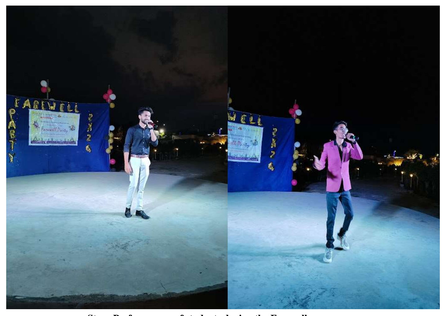
Stage Performances of students during the Farewell program