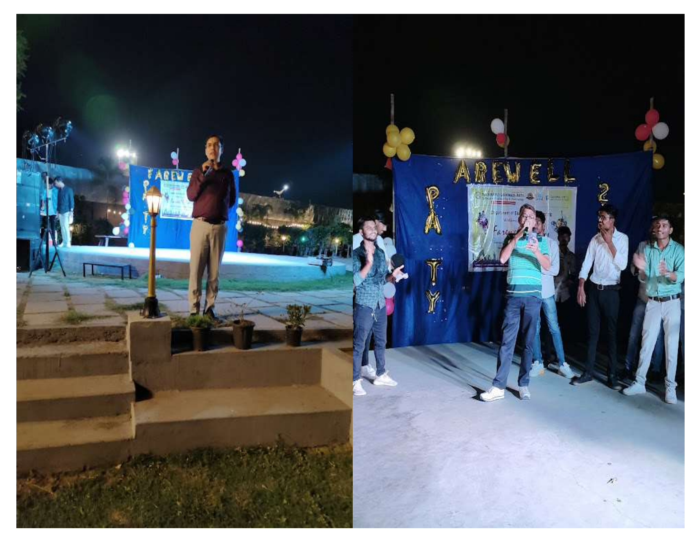
Singing Performances by the faculties of department