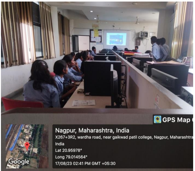
Students interaction and participation in Guest Lecture on "CLOUD COMPUTING ESSENTIALS"