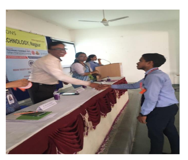
Glimpse of Forum Installation and Guest Lecture