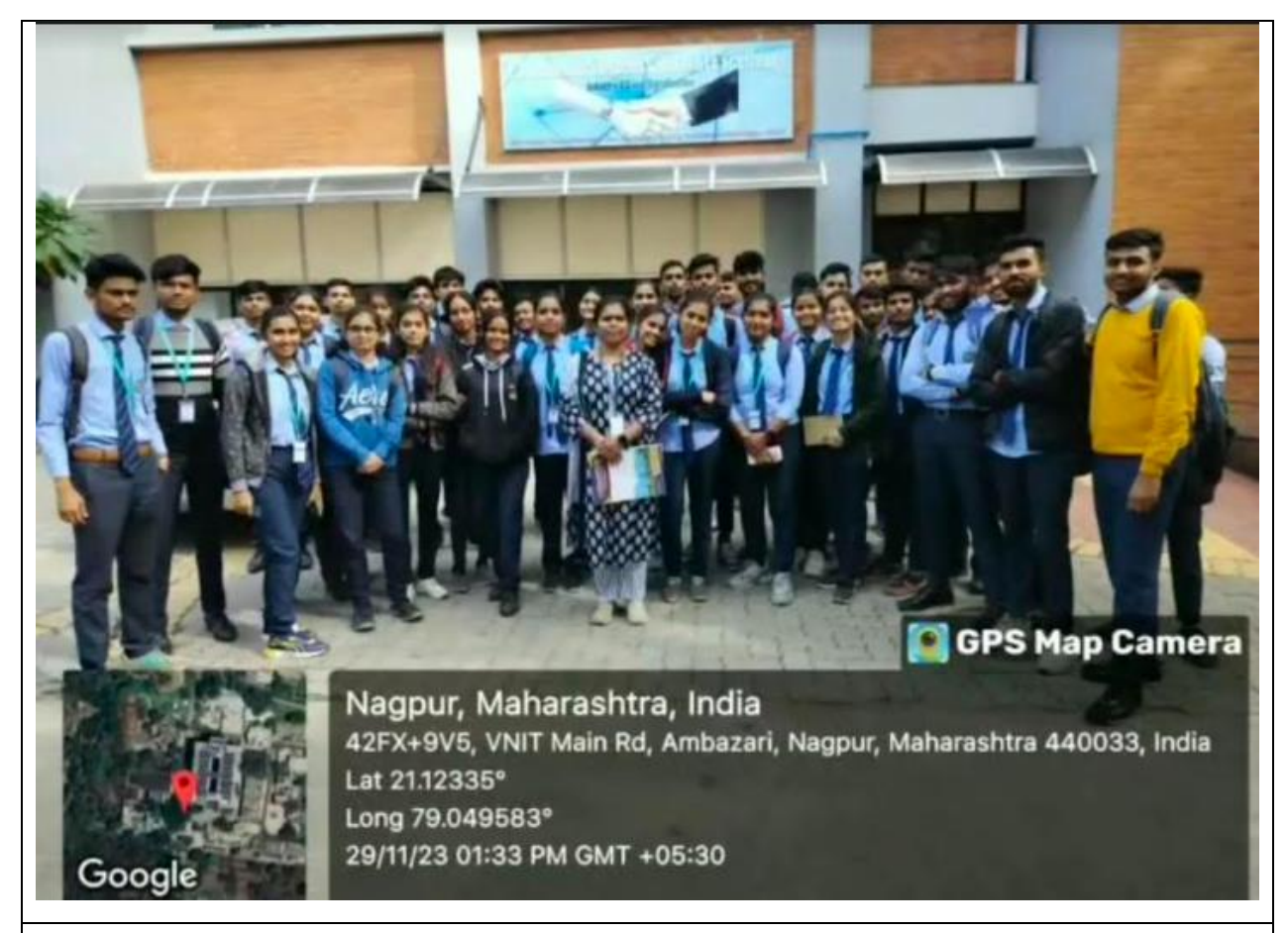
Glimpse of Industrial Visit at "V.R. Siemens, VNIT College of Engineering, Nagpur.