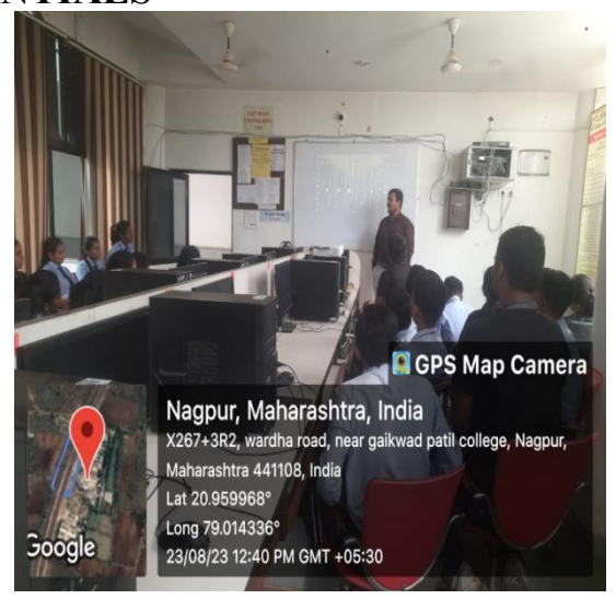
Students participation in Guest talk on "WEB DEVELOPMENT TOOLS AND AGILE METHODOLOGY"