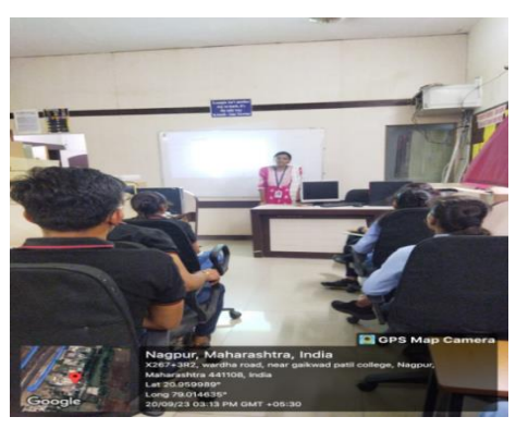
Glimpse of Induction Program