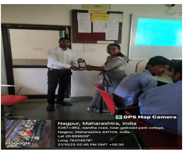
Glimpse of Two days Workshop on "Language Oriented Programming"