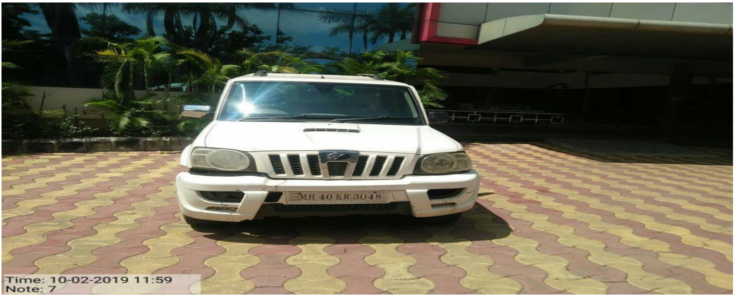
Vehicle for Medical Emergency