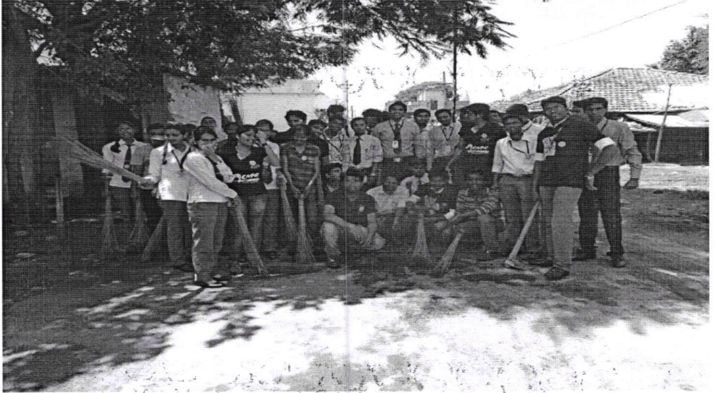
Students participating in sanitization awareness