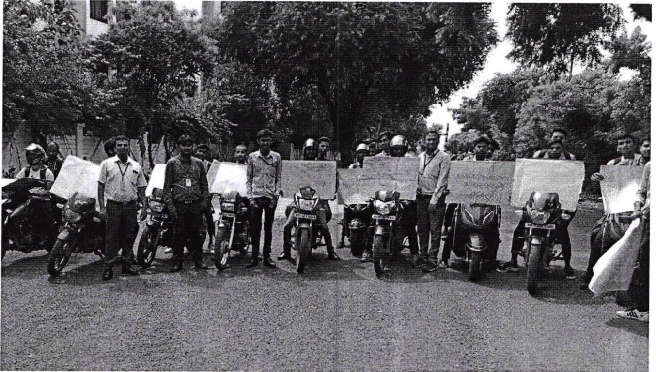
Students along with hording spreading message of Hygiene awareness