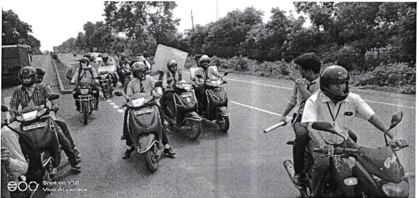
Students in bike rally for Hygiene awareness